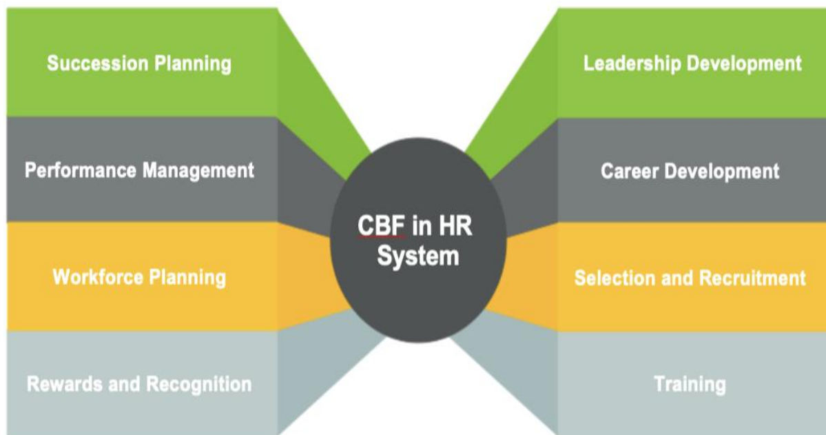
Figure 2. CBF in key HR system

The Royal Civil Service Commission (RCSC) has introduced Competency Based Framework (CBF) with the objective of enhancing service delivery of the civil servants through providing platform for desired professional development. In absence of a relevant framework to guide the professional development of the civil servants in the country, competency and efficiency at work place have always been a concern to realize the national goals and objectives. The RCSC has recognized the need to enhance service delivery of civil servants through professional and personal development which will have sustainable impact in the system. With introduction of CBF across all the major occupational groups, civil servants will be guided by the principles of knowledge, skills and ability and is expected to enhance performance and service delivery.