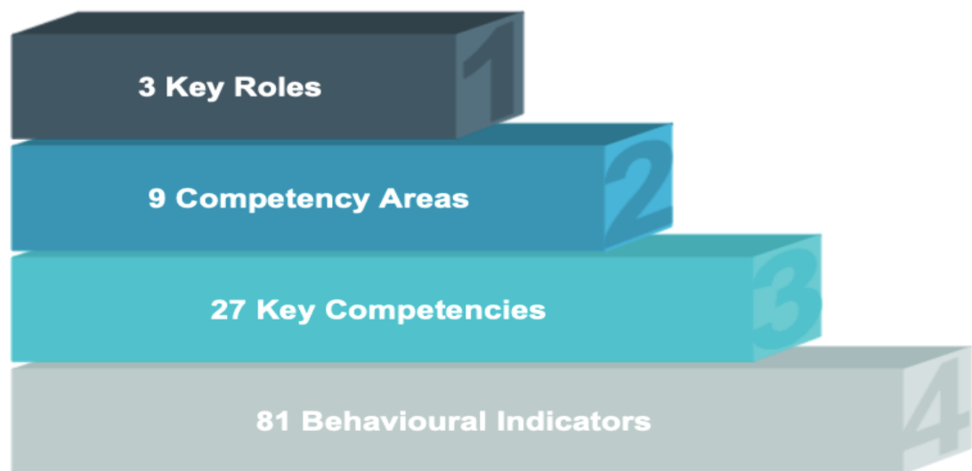
Figure 3. Key roles, competency areas and behavioral indicators

This framework is designed to guide the agriculture officers not only in strengthening their competency but also in improving their behaviors at work place. In total, 3 Key Roles, 9 Competency Areas, 27 Key Competencies and 81 Behavioral Indicators were identified for agriculture officers. CBF will provide platform for them to become a good leader at work place with required professional and behavioral competencies.