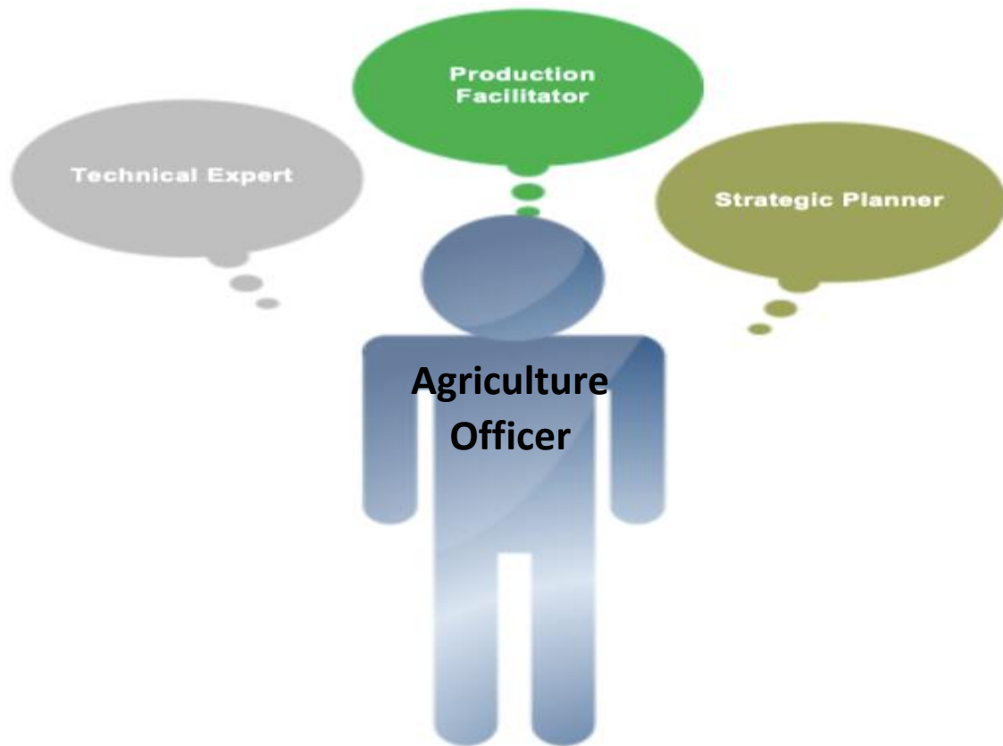
Figure 6. Key roles of Agriculture Officer

The key role is an organized set of behaviors that are crucial to achieve the current and future goals of the Department of Agriculture. Following are the key roles expected to be performed by the Agriculture Officers.