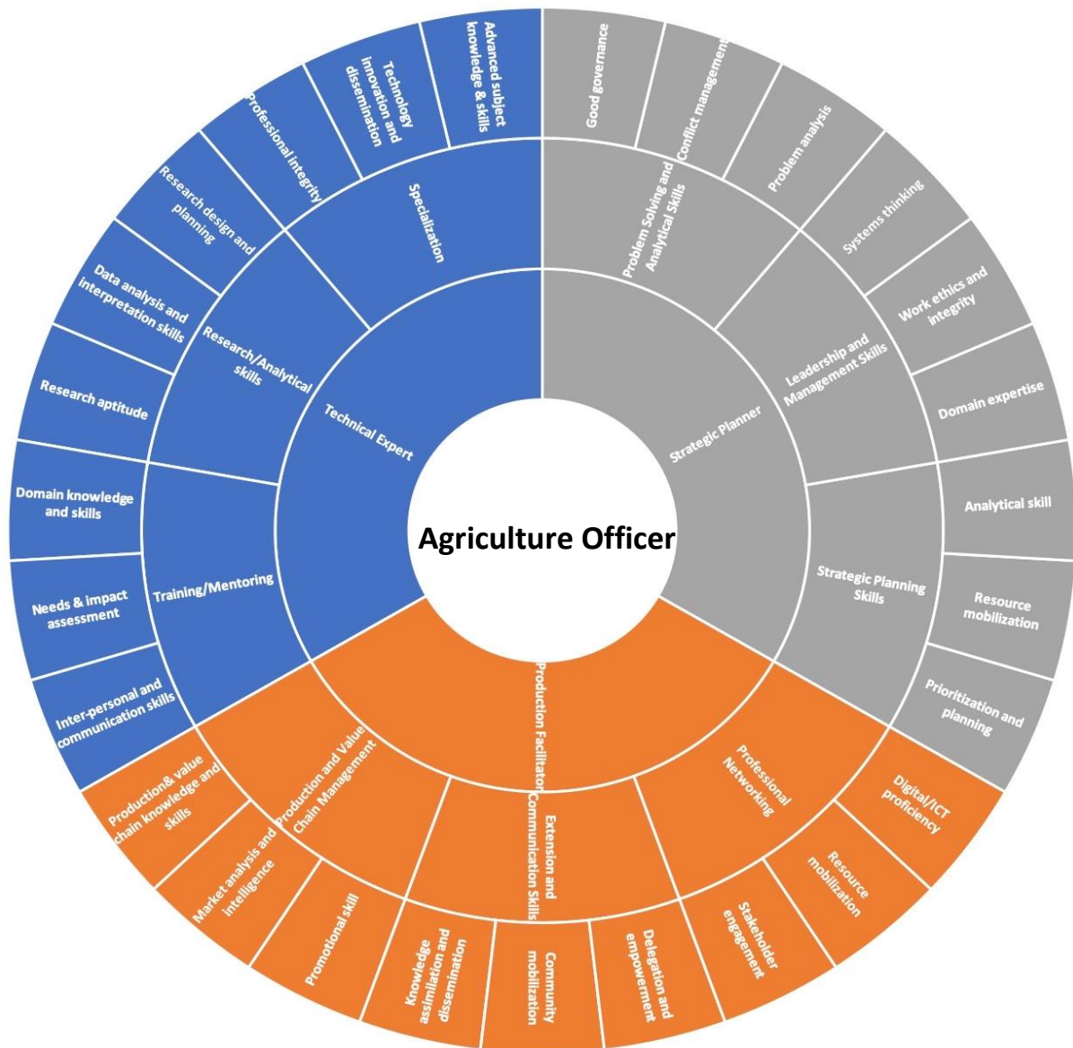
Figure 5. Diagrammatic overview of CBF for Agriculture Officer

The CBF structure is diagrammatic overview of the key roles and competency areas required for the Agriculture Officers. The pie diagram shows that each Key Role of an Agriculture Officer is sub-divided into 3 Competency Areas and each Competency Area is further sub-divided into 3 Key Competencies. In total, 3 Key Roles, 9 Competency Areas, 27 Key Competencies were identified.