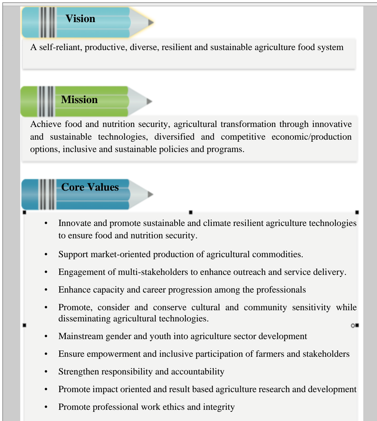
Figure 1. Vision, Mission and Core Values of the Department of Agriculture