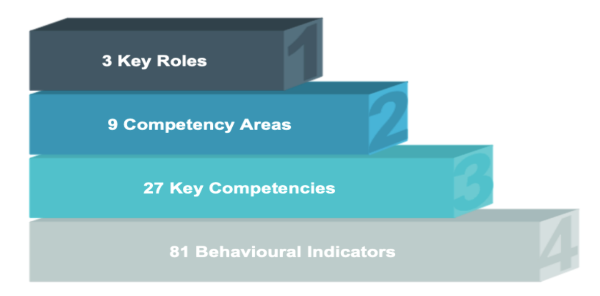
Figure 3. Key roles, competency areas and behavioral indicators

This framework is designed to guide the agriculture officers not only in strengthening their competency but also in improving their behaviors at work place. In total, 3 Key Roles, 9 Competency Areas, 27 Key Competencies and 81 Behavioral Indicators were identified for agriculture officers. CBF will provide platform for them to become a good leader at work place with required professional and behavioral competencies.