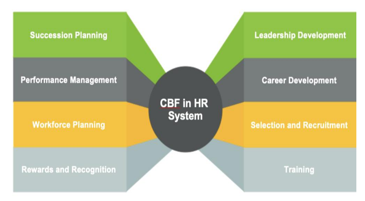
Figure 2. CBF in key HR system

The Royal Civil Service Commission (RCSC) has introduced Competency Based Framework (CBF) with the objective of enhancing service delivery of the civil servants through providing platform for desired professional development. In absence of a relevant framework to guide the professional development of the civil servants in the country, competency and efficiency at work place have always been a concern to realize the national goals and objectives. The RCSC has recognized the need to enhance service delivery of civil servants through professional and personal development which will have sustainable impact in the system. With introduction of CBF across all the major occupational groups, civil servants will be guided by the principles of knowledge, skills and ability and is expected to enhance performance and service delivery.