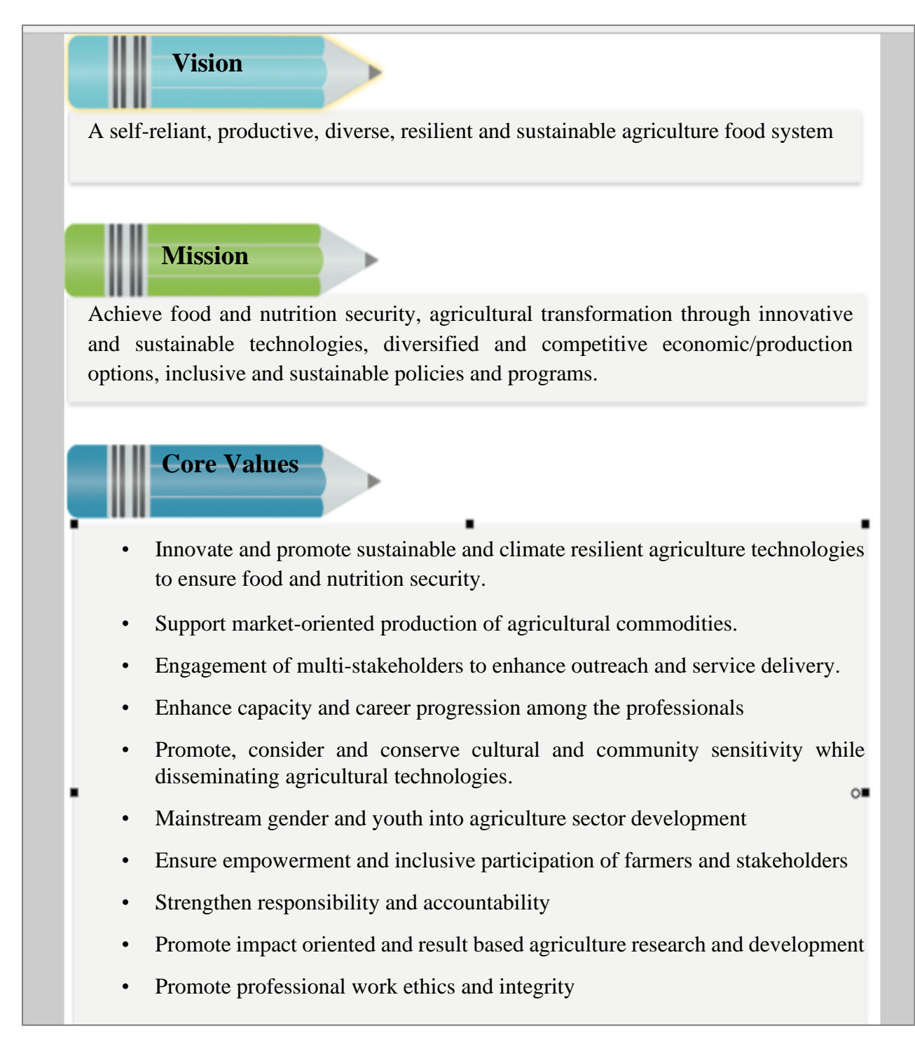
Figure 1. Vision, Mission and Core Values of the Department of Agriculture