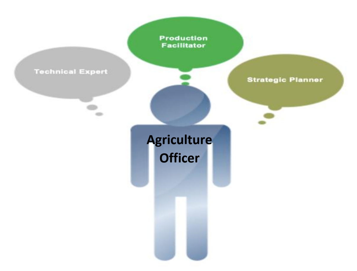
Figure 6. Key roles of Agriculture Officer

The key role is an organized set of behaviors that are crucial to achieve the current and future goals of the Department of Agriculture. Following are the key roles expected to be performed by the Agriculture Officers.